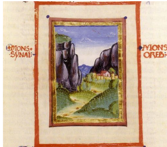
BSB München, Clm 189, fol. 55r